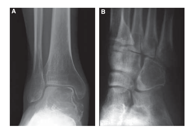
Figure 2. Radiograph of GCT involving the talus (A) and cuboid (B). As in Figure 1, both lesions are purely lytic with partially sclerotic rim, although the expansion of bone is not prominent. The lesions appear eccentric.

The authors were able to confirm the histological findings of nine cases with the help of a pathologist. During H-E staining, the typical histological characteristics of bone GCT were recognized in five cases,