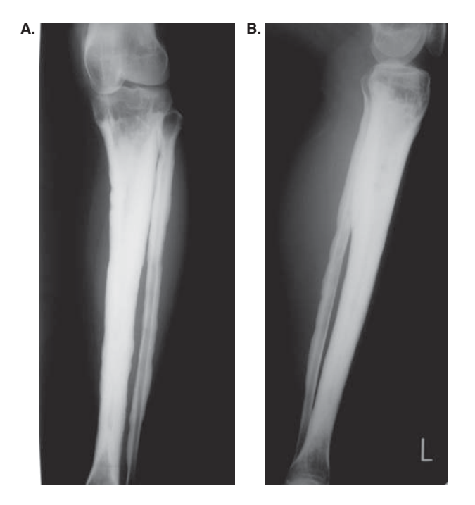
Figure 1. Anteroposterior (A) and lateral (B) radiograms of the left lower leg show diaphyseal widening and cortical thickening of the tibia and fibula.

cytologic atypia, on the basis of which a pathologic diagnosis of enchondroma was made (Figure 4). The postoperative course was uneventful. No evidence of recurrence was observed at the 5-year follow-up examination.