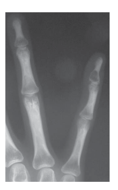
Figure 2. Anteroposterior radiogram of the distal phalanx of the little finger shows distension and thinning of the cortex around a radiolucent lesion.

Progressive diaphyseal dysplasia (PDD), or Camurati-Engelmann disease (CED), is a rare, autosomal dominant genetic disorder characterized by sclerosing