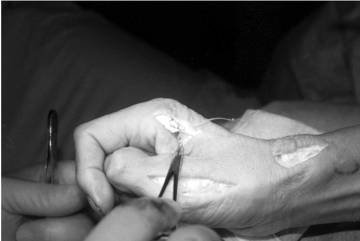
Figure 1. The extensor pollicis brevis tendon is freed at the metacarpo-phalangeal joint of the thumb, and withdrawn to the proximal end of the anatomical snuff-box. The re-routed extensor pollicis brevis tendon is sutured to the tendinous portion of the first dorsal interosseous muscle near its insertion.

The results were evaluated into four categories according to Akahori's criteria (5). Excellent was complete or almost complete recovery. Good meant that the patient had recovery of motor function with a negative Froment sign and clawing of fingers with some residual complaints. Fair was slight improvement with no functional recovery. Poor was no benefit from the operation. Grip and pinch strength were measured before and after surgery. Statistical analysis was performed with Student's t test, and a P -value of less than 0.05 was considered significant.