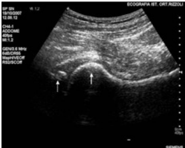
Figure 2. Ultrasound imaging of hip joint: a 3.5 MHz convex probe was used. Broken arrow: acetabulum - Solid arrow: femoral head.

needle is simpler, quicker and more accurate (16). Moreover, utilising a real-time biopsy guidance software, the progression of the needle into the capsular recess may be monitored, so optimizing the procedure.