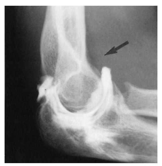
Figure 1 B Elbow with adhesion of the anterior capsule. Arthrogram revealed no infiltration of contrast medium to the cornoid fossa (arrow), which means an adhesion of the anterior capsule.

In all patients, isometric flexion-extension exercise was started on the day after surgery, and active and passive motion with slow stretching of the elbow were be-