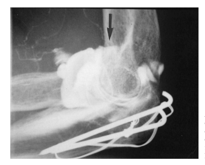
Figure 1 A Elbow without adhesion of the anterior capsule. Arthrogram of the elbow showed infiltration of contrast medium to the coronoid fossa (arrow), which means no adhesion of the anterior capsule.

Operations were performed under brachial plexus block or general anesthesia with an air tourniquet applied. The operations were aimed to restore motion during an arc of 20^{\circ} to 120^{\circ} of flexion. A posterior surgical approach was used in 18