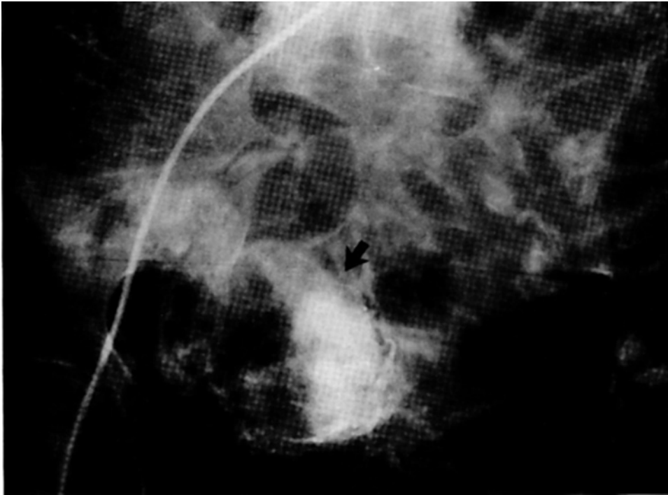
Fig. 1. Angiography of the superior mesenteric artery, parenchymal phase. Irregular dilated veins are draining the tumour (arrows).

extensive bleeding during the operation, due to venous drainage from the area. Continuous postoperative bleeding necessitated re-operation after four hours. A tamponade had to be used to control the bleeding.