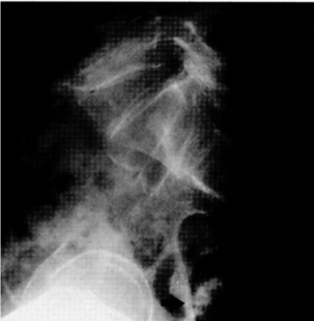
Fig. 3 b

Figs 3 a and b. Frontal (a) and lateral (b) plain radiographs of the lumbo-sacral region. The calcification is visible in front of the lower end of the sacrum (arrows).