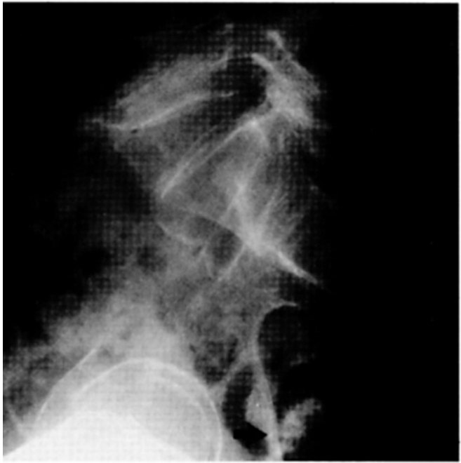
Fig. 3 b