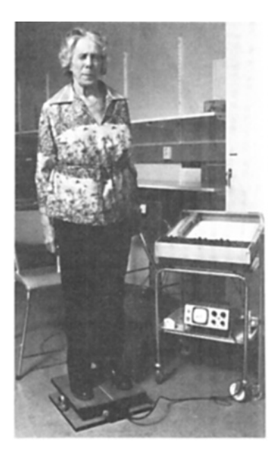
Fig. 3. Stroke patient (left hemiplegia) standing on a force platform for balance tests by methods described by Eklund and Löfstedt (5).